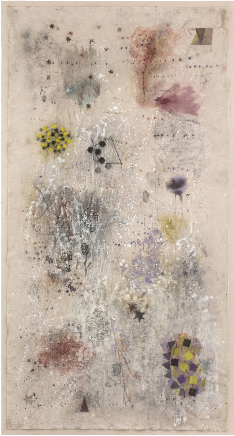
Threshold 2, 2021, pencil, charcoal, pastel, collage on unprimed cotton duck, 186 x 100 cm