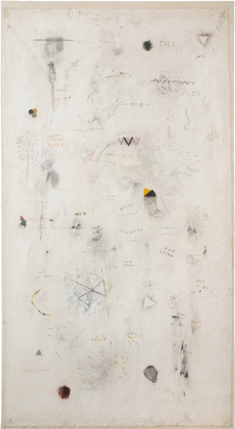
Moments 1 - Mind's Eye, 2019, pencil, charcoal, pastel, collage on unprimed cotton duck, 187 x 102 cm (detail shown at start)